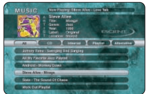
FireBall SE-80 TV User Interface Guide

The most intuitive interface on the planet is standard on FireBall.