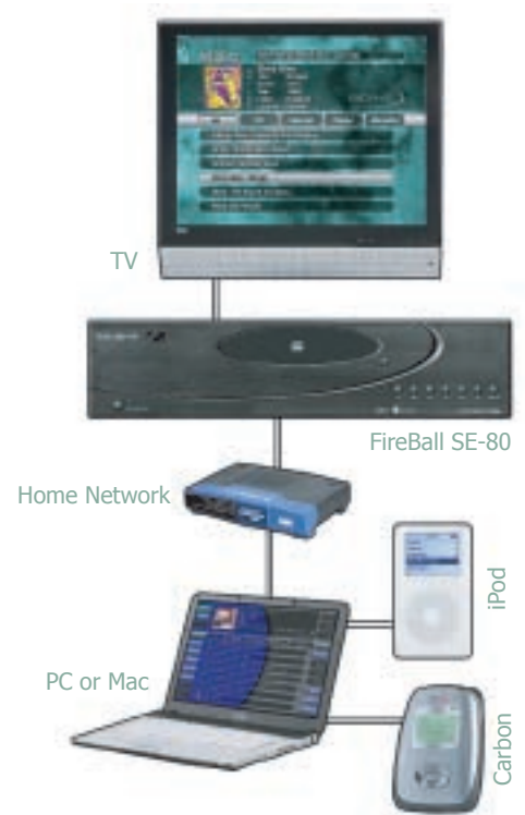
Typical installation but PC or Mac is not required.