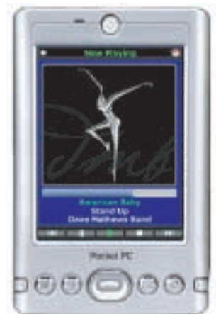
FireBall SE-80 PDA Interface